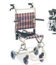
TC800LBJ Transit Wheel Chair, Aluminum Light Weight Chair Frame, 6" Rear Solid Castors, 5" Front Castors, Flip Armrest, Drop Back Handle, Lockable Attendant Brake, With Seat Belt.