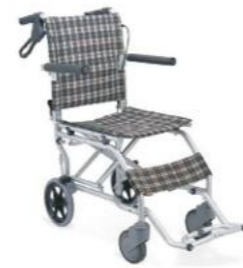
TC9003L Aluminum Frame, 5" Castor, 8" PVC Rear Wheel, Foldable Back With Brake.