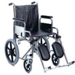
TC907BC Chromed Steel Frame, Detachable Desk Armrest, Elevating Footrest, Solid Castor, Pneumatic Mag Wheel.