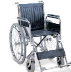
TC901 Chromed Steel Frame, Detachable Armrest, Detachable Footrest, PU Castor, Pneumatic Rear Wheel