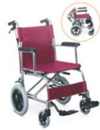
TC805LABJ Aluminum Light Weight Chair Frame, Fixed Armrest, Flip-Up Footplate, Solid Castor, Pneumatic Rear Mag Wheel, Drop Back Handle, United Brake.