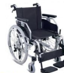
TC205LHQ Aluminum Chair Frame, Flip-Up And Height-Adjustable Inclined Armrest. Detachable Footrest, Solid Castor, Quick Release, Pneumatic Rear Wheel, Carrying Wheel And Anti-Tippers, Angle-Adjustable Footplate, Locking Drum Brake.