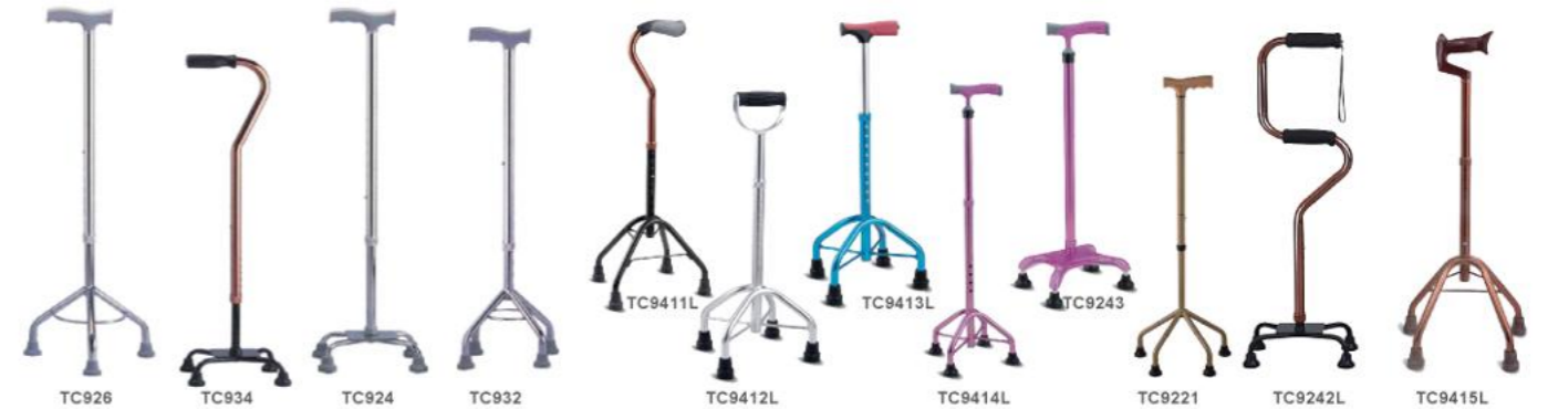
TC926 TC934 TC924 TC932 TC9411L TC9412L TC9413L TC9414L TC9221 TC9242L TC9415L