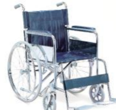
TC874A Chromed Steel Frame, Fixed Armrest, Fixed Footrest, Drop Back Handle, Solid Castor, Solid Rear Wheel, Double Cross Bars