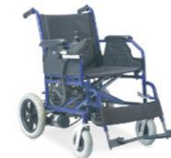
TC112 Resin-Coating Steel Frame, Fixed Armrest, Detachable, Footrest, Mag Drive Wheel, Rubber Foam Castor, Foldable Chair Frame.