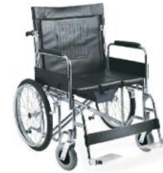
TC607-70 Chromed Steel Heavy Duty Frame PU Castor Solid Wheel Fixed Armrest And Footrest 70cm Seat Width