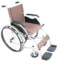
TC874LF5 Aluminum Chair Frame, fixed armrest and footrest, solid castor, 24" PU wheel, with brake