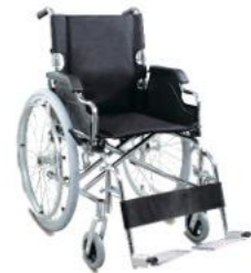
TC908AQ Chromed Steel Frame, Flip-up Desk Armrest, Detachable Footrest, Solid Castor, Quick Release Pneumatic Rear Wheel, Drop Back Handle