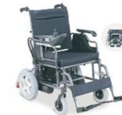
TC121 Powder Coating Steel Frame, Flip-UP Desk Armrest, Detachable Footrest, Rubber Foam Castor And Drive Wheel, Foldable Backrest