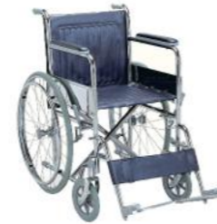
TC972 Chromed Steel Frame, Fixed Armrest, Detachable Footrest, Solid Castor, Solid Rear Wheel