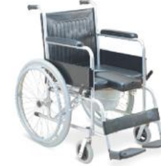
TC609LU Foldable Aluminum Chair Frame, U Shape Commode Seat, Fixed Armrest And Footrest, Solid Castor, Pneumatic Rear Wheel.