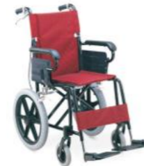
TC871LBJ Aluminum Light Weight Chair Frame, Fixed Armrest & Footrest, Solid Castor, Pneumatic Mag Wheel, With United Brake.