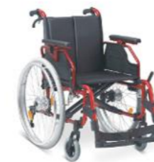
TC231LHPQ Aluminum Chair Frame, Flip-UP Height-Adjustable Inclined Armrest, Detachable Footrest, PU Castor, Quick Release PU Rear Wheel, Locking Drum Brake, Anti-Tippers, Angle-adjustable Footplate.