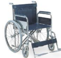
TC975-51 Chromed Steel Frame, 20" Seat Width Detachable Armrest And Footrest, Solid Castor Pneumatic Rear Wheel