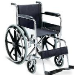
TC809B Chromed Steel Frame, Fixed Armrest, Fixed Footrest, Solid Castor, Solid Mag Wheel