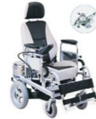
TC122L Aluminum Frame, Vehicle Seat, With Reclining Back, Detachable Arm And Footrest, Mobile Seat, PU Castor, PU Drive Wheel