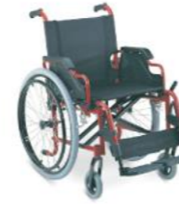
TC903LQ Aluminum Frame, Flip-Up Desk Armrest, Detachable Footrest, Solid Castor, Quick Release Pneumatic Rear Wheel.