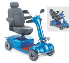
TC140 Comfortable Cehicle Seat, Adjustable Backrest and Seat Height, Flip-Up Armrest. Rubber Foam Wheel, With Driving Lamp.