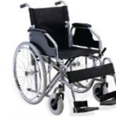
TC876 Chromed Steel Frame, Fixed Armrest, Fixed Footrest, Solid Rear Castor, Rear Wheel Pneumatic