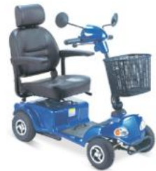
TC141 Comfortable Swivel Seat, Flip-Up Armrest, Driving Lamp And Luggage Basket. Rubber Foam Castor Rubber Foam Rear Wheel.