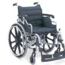
TC950LBPQ-46 Aluminum Chair Frame, Flip-UP And Height-Adjustable Inclined Armrest, Detachable Footrest, Solid Castor, Quick Release PU Mag Wheel, Anti-Tippers, Angle-Adjustable Footplate.