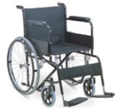
TC875 Powder Coating Steel Frame, Fixed Armrest, Fixed Footrest, Solid Castor, Solid Rear Wheel.