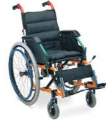
TC980LA-35 Pediatric Wheel Chair Aluminum Chair Frame, Flip-UP Armrest, Fixed Footrest, Solid Castor, Pneumatic Rear Wheel, Drop Back Handle.