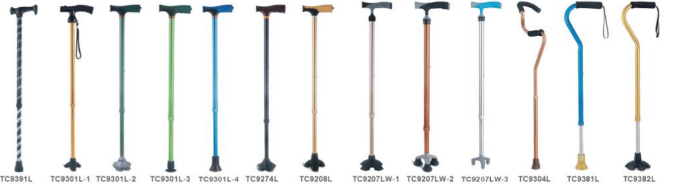
TC9391L TC9301L-1 TC9301L-2 TC9301L-3 TC9301L-4 TC9274L TC9208L TC9207LW-1 TC9207LW-2 TC9207LW-3 TC9304L TC9381L TC9382L