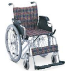
TC983L Aluminum Frame, Flip-UP Desk Armrest, Fixed Footrest, Solid Castor, Pneumatic Rear Wheel.