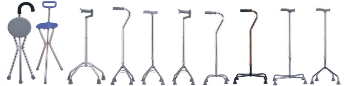
TC911L TC940L TC942L TC9321S TC9322S TC9323S TC9424S TC921 TC931 TC922