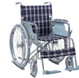
TC864L Aluminum Light Weight Frame, Fixed Footrest, Solid Castor, Pneumatic Rear Wheel