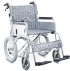
TC870LAJ Aluminum Light Weight Chair Frame, Fixed Armrest, Fixed Footrest, Solid Castor, Pneumatic Rear Wheel, Drop Back Handle, With United Brake.