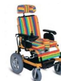
TC121LF1 Powered Pediatric Wheel Chair, Aluminum Chair Frame, Adjustable PU Armrest, Adjustable Seat Width, Reclining High Back, Lithium Battery, Rubber Foam Drive Wheel.