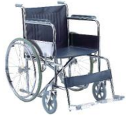
TC809 Chromed Steel Frame, Fixed Armrest, Fixed Footrest, Solid Castor, Solid Rear Wheel