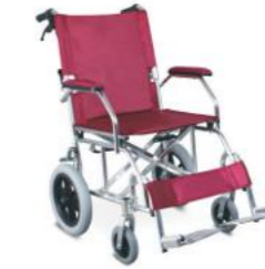
TC863LABJ Aluminum Light Weight Chair Frame, Fixed Armrest, Flip UP Footrest, Solid Castor, Pneumatic Rear Mag Wheel, Drop Back Handle, Locking United Brake.