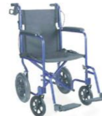
TC976LA-12: Aluminum Frame Detachable Footrest Drop Back Handle, Aitk Brake. Solid Castor And Wheel