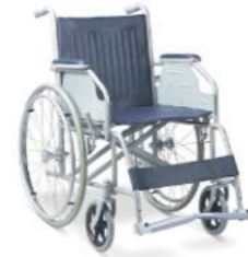
TC869X Powder Coating Steel Frame, Double Cross Bar, Fixed Inclined Armrest, Fixed footrest, Solid Castor solid Rear Wheel.