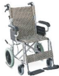
TC873LABJP Aluminum Light Weight Chair Frame, Fixed Armrest, Fixed Footrest, Solid Castor, PU Rear Mag Wheel, Drop Back Handle, Locking Unit Brake.