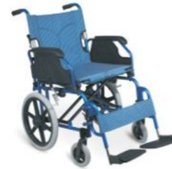
TC207LABP Aluminum Chair Frame, Flip-Up Inclined armrest, Detachable footrest, Solid Castor, PU/Rear/Mag/Wheel, Drop back handle