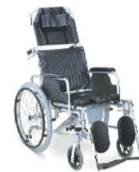
TC654LGCU Stainless Steel Chair Frame, Flip Down Armrest, Detachable Elevating Footrest, U Shape Commode Seat. Pneumatic Rear Wheel, Solid Castor.