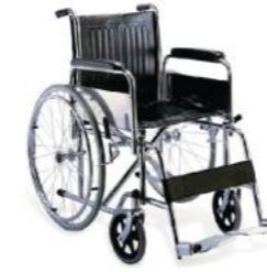
TC983 Chromed Steel Frame, Detachable Armrest, Fixed Footrest, Solid Castor, Solid Wheel