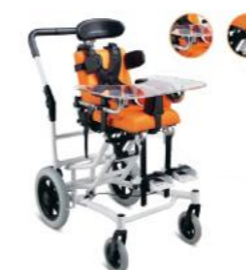
TC958LBPYF8 Aluminum Adapting Child Wheel Chair Adjustable Seat Size And Seat Height, Push Handle, Movable Armrest, Optional Accessories: Food Table, Height/Adjustable Footrest And Adjustable Headrest, Tilttable Seat, Reclining Back, PU Wheels.