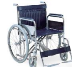
TC810Y Chromed Steel Frame, Fixed Armrest, Fixed Footrest, Solid Castor, Solid Rear Wheel, Hard Seat Cushion.