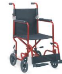
TC976LAB Aluminum Chair Frame, Fixed Armrest. Detachable Footrest, Solid Castor, Solid Rear Mag Wheel, Drop Back Handle