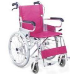
TC872LJ Aluminum Frame With United Brake, Pneumatic Wheel, Fixed Armrest, And Fixed Footrest