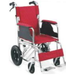
TC865BLJ Aluminum Frame With United Brake, Solid Castor, PU Mag Wheel, Fixed Armrest, Fixed Footrest