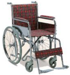
TC802-35 Children Type, Chromed Steel Frame, Fixed Armrest, Fixed Footrest, Solid Castor, Solid Rear Wheel