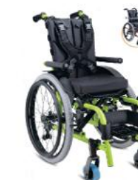
TC980LQF8 Aluminum Adapting Child Wheel Chair, Adjustable Seat Size, Solid Castor, Flip-UP Armrest, Fixed Footrest, Height Adjustable Footplate, Quick Release Pneumatic Rear Wheel.