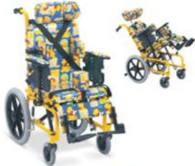
TC985LBGY-38 Aluminum Chair Frame, Adjustable Headrest, Detachable Armrest, Fixed Footrest, Solid Castor, Pneumatic Mag Wheel, Adjustable Seat Angle, Safety Belt.