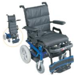
TC139 Power Stand Up Wheel Chair, Powder Coating Frame, Flip-Up, Armrest With Single Controller, For Both Driving & Seat Lifting. Strong Rubber Foam Drive Wheel, Special Design With Comfort, Safety Legrest Belt.