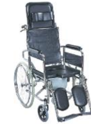
TC609GCU Foldable Chromed Steel Frame, Plastic Commode Seat, Reclining High Back, Detachable Armrest And Elevating Footrest, Solid Castor And Rear Wheel