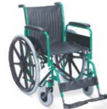
TC901B Powder Coating Steel Frame, Detachable Armrest, Detachable Footrest, PU Castor, Pneumatic Mag Wheel.