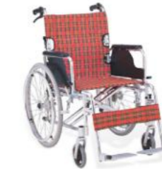
TC908LAH Aluminum Chair Frame With Drum Solid Castor, PU Wheel, Flip Up Armrest Detachable Footrest