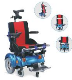
TC159L Standing Walking&nursing Intelligent Type Standing Power Wheel Chair, Aluminum Frame, 200*50 PU Front Castors, 12" PU Drive Wheels, Adjustable Head&Neck Rest, Adjustable Leg Pad