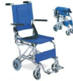
TC807LABP Transit Wheel Chair, Aluminum Light Weight Chair Frame, 6" Rear Solid Castors, 5" Front Castors, Flip-Up Armrest, With Seat Belt