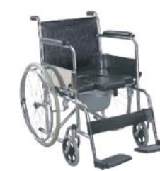
TC609U Foldable Chromed Steel Frame, Plastic Commode Seat, Fixed Armrest And Footrest, Solid Castor And Rear Wheel.