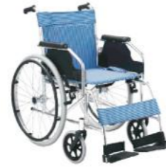
TC868L Aluminum light Weight Frame, Solid Castor And Wheel, Fixed Armrest And Footrest