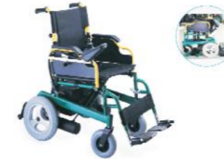
TC111A Powder Coated Steel Frame, Foldable, Flip Up Armrest, Detachable Footrest, Drop Back Handle, PU Castor, PU Drive Wheel