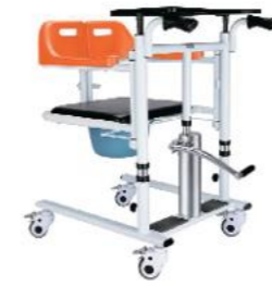
TC7905CO Senior Citizen Walking Aid