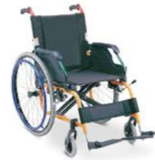
TC980LA Aluminum Chair Frame, Flip-UP Armrest, Fixed Footrest, Solid Castor, Pneumatic Rear Wheel, Drop Back Handle.