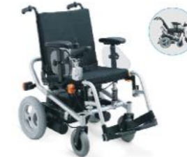
TC152 Powder Coated Steel Frame, Seat with Reclining, Back Adjustable Armrest, Detachable Footrest, PU Castor, PU Drive Wheel, With Safety Lamp