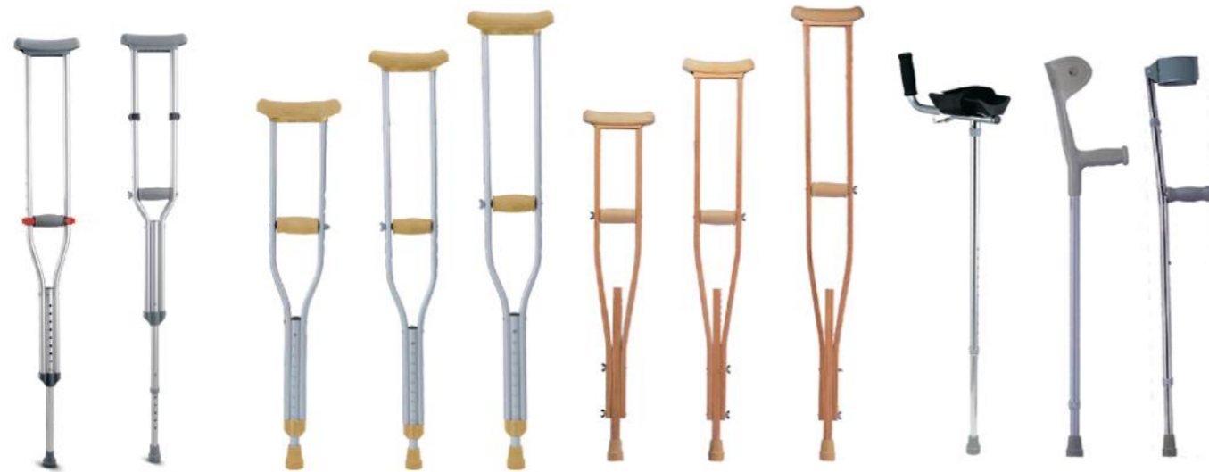
TC9251L TC9252L TC925L(S) TC925L(M) TC925L(L) TC935(S) TC935(M) TC935(L) TC9204L TC937L TC933L