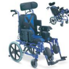
TC958LBCGPY-38 Aluminum Chair Frame, Reclining High Back, Adjustable Headrest, Detachable Armrest, Elevating Footrest, Solid Castor, PU Mag Wheel, Adjustable Seat Angle, Safety Belt