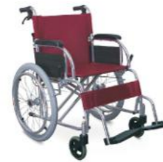
TC878LAJ Aluminum Light Weight Chair Frame, Fixed Armrest, Flip Up Footrest, Solid Castor, Pneumatic Rear Mag Wheel, Drop Back Handle, Locking United Brake.