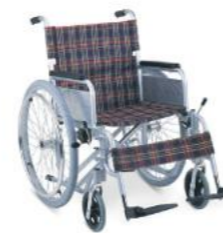
TC974LP Aluminum Frame, Fixed armrest, Detachable footrest, Solid castor, PU/Rear/Wheel.