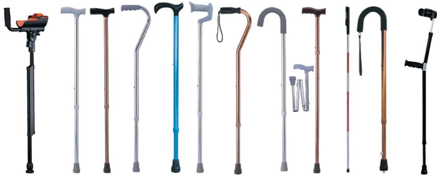
TC-YC852 TC920L TC9201L TC928L TC929L TC930L TC938L TC9282L TC927L TC936L TC9283L TC923L