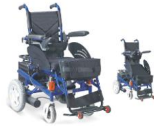
TC129 Power Stand Up Wheel Chair ,Powder Coating Frame, Flip-Up, Armrest With Single Controller, For Both Driving & Seat Lifting. Strong Rubber Foam Drive Wheel, Special Design With Comfortable, Safety Legrest Belt.