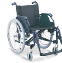
TC955L Aluminum Chair Frame, Flip-Up Inclined Armrest, Detachable Footrest, Solid Castor, Pneumatic Rear Wheel.