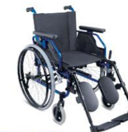
TC250LCPQ Aluminum Chair Frame, Flip-Up And Height-Adjustable Inclined Armrest. Dechable Elevating Footrest, PU Castors, Quick Release PU Rear Wheel, Anti-Tippers, Angle-Adjustable Footplate.