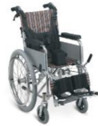
TC874LAJF1-30 Pediatric Wheel Chair Aluminum Chair Frame, Fixed Armrest, Fixed Footrest, Solid Castor, Pneumatic Rear Wheel, Drop Back Handle, With United Brake.