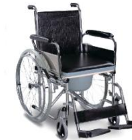
TC681 Foldable Chromed Steel Frame, Plastic Commode Seat, Flip-Up Armrest And Detachable Footrest, Solid Castor And Solid Rear Wheel.