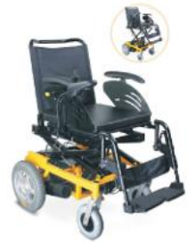
TC124 Resin-Coating Steel Frame, Adjustable And Detachable Armrest Pad, Detachable Sideboard, Rubber Foam Castor And Drive Rear Wheel. Electrically Lifting Seat Plate.