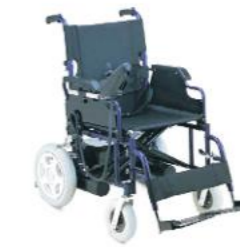
TC110A Powder Coating Steel Frame, Foldable Flip up Armrest, Detachable, Footrest, Drop Back Handle, PU Castor, PU Drive Wheel