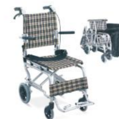
TC804LABJP Transit Wheel Chair, Aluminum Light Weight Chair Frame, 8" Rear Solid Castors, 5" Front Castors, Flip-Up Armrest, Drop Back Handle, Lockable Attendant Brake, With Seat Belt.