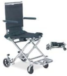
TC803LB Transit Wheelchair, Aluminum Light Weight Chair Frame, 6" Rear Solid Castors, 4" Front Castors, Flip-UP Armrest, With Seat Belt