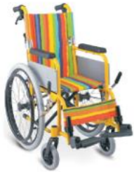
TC874LAJ-30 Pediatric Wheel Chair Aluminum Chair Frame, Fixed Armrest, Fixed Footrest, Solid Castor, Pneumatic Rear Wheel, Drop Back Handle, With United Brake.