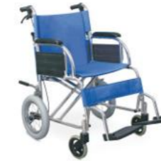
TC879LAJ Aluminum Light Weight Chair Frame, Fixed Armrest, Flip UP Footrest, Solid Castor, Pneumatic Rear Wheel Drop Back Handle, Locking United Brake.