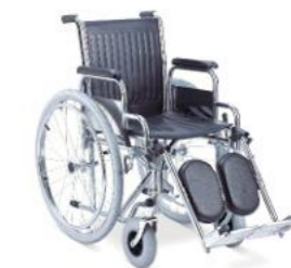
TC902C Chromed Steel Frame, Detachable Desk Armrest, Elevating Footrest, PU Castor, Pneumatic Rear Wheel