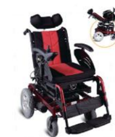
TC131GC Steel Chair Frame, Adjustable And Detachable Armrest, Detachable Footrest, Rubber Foam Castor And Drive Rear Wheel, Electrical Lifting Seat, Adjustable Seat Angle.