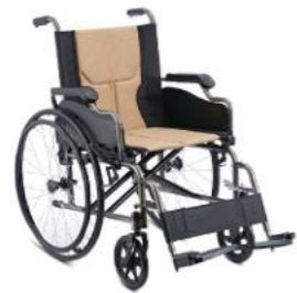
TC909 Powder coating steel frame, Flip-up desk armrest, Detachable footrest, Solid castor, Solid rear wheel