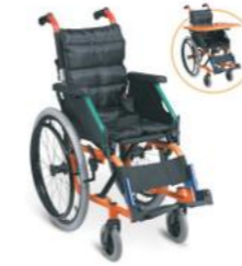
TC980LA-30 Pediatric Wheel Chair Aluminum Chair Frame, Flip-Up Armrest, Fixed Footrest, Solid Castor, Pneumatic Rear Wheel, Drop Back Handle.