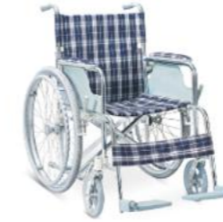
TC864LY Aluminum Chair Frame, Fixed Armrest, Fixed Footrest, Plastic Footplate Hard Cushion, Solid Castor, Pneumatic Rear Wheel Plastic Hand Rim