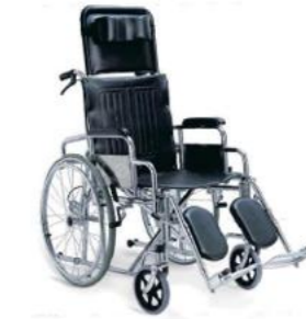
TC903GC Chromed Steel Frame, 8" PVC Castor, 24" Solid Wheel, Detachable Armrest, Elevating Footrest, Reclining High Back